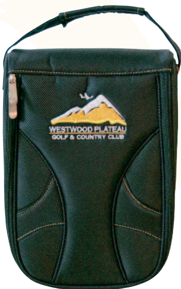
Westwood Plateau Shoe Bag